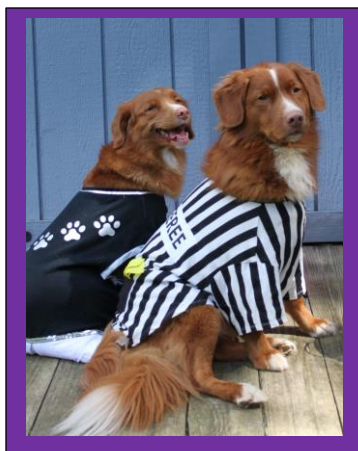
Vice and Tukka as Tailgaters and Channel and Zaya as Rufferee and Cheerleader. Rudy celebrating Dogtoberfest and Macy as a Unicorn Princess.