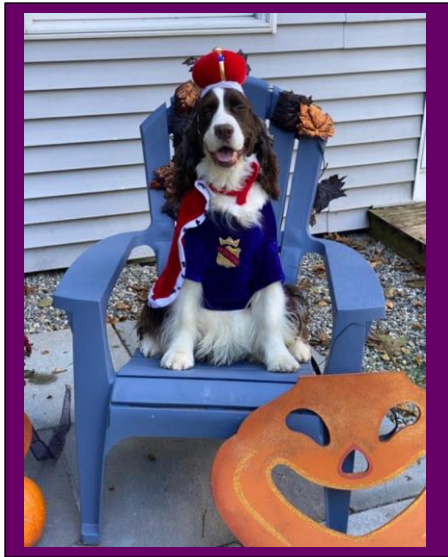
King Roland and his Creepy Court!